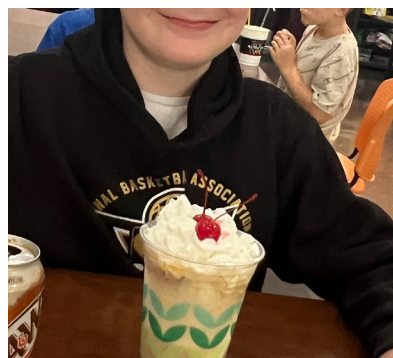
Yummy Root Beer Float Day, enjoyed by all.