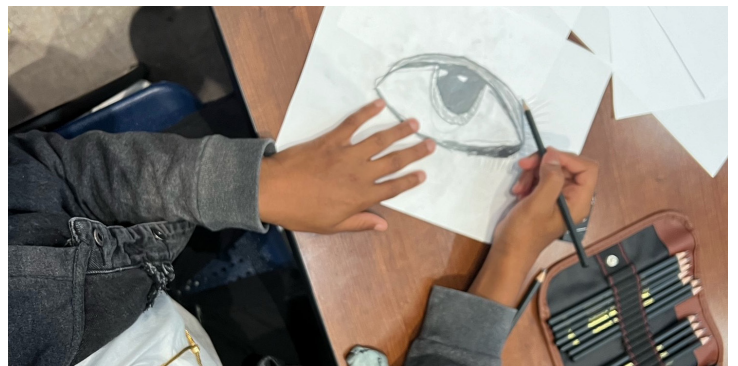
Art class, letting the inner talent bloom.