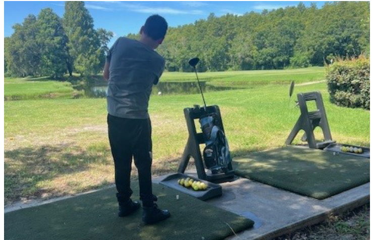
A fun day at the Wentworth Golf Course.

Life Enrichment is a cornerstone of our work with foster children, and an integral part of their healing. We are committed to providing innovative, exciting, and FUN activities for the residents who call Joshua House "home."