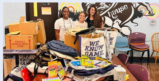
Donation from Foot Locker.