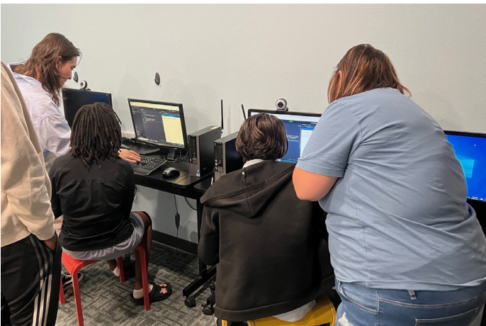
Learning to code, such a great opportunity.