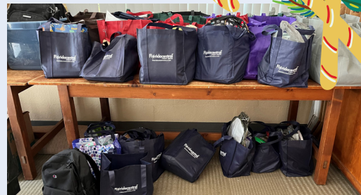
Donation from Floridacentral Credit Union.

The future is brighter for our foster children, and we cannot express how much all of your support means!